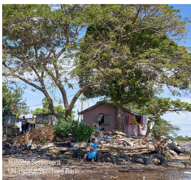
Nasoata Settlement

The upgrading project in Ledrusasa started in 2013 and has produced 78 residential lots, an open space and a civic lot, providing access to fully serviced housing lots to 390 people. Among the upgrading interventions implemented by the MHCD are: installation of basic infrastructure, regularisation of security of tenure, community open spaces, etc.