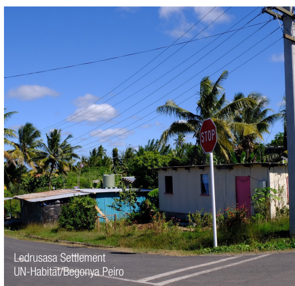
Ledrusasa Settlement