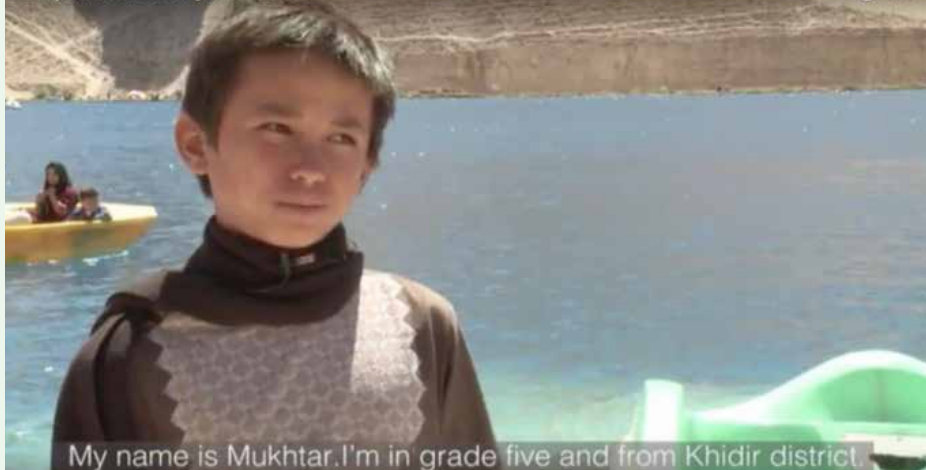
Bamiyan Voice of Afghan Youth