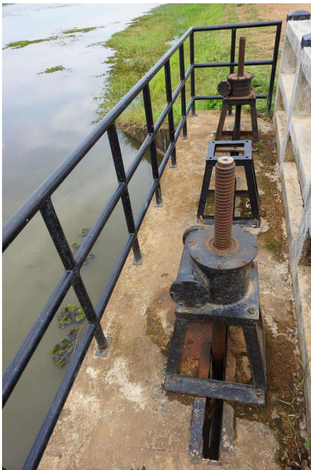
Figure 4 “underpass O Thmar sluice”