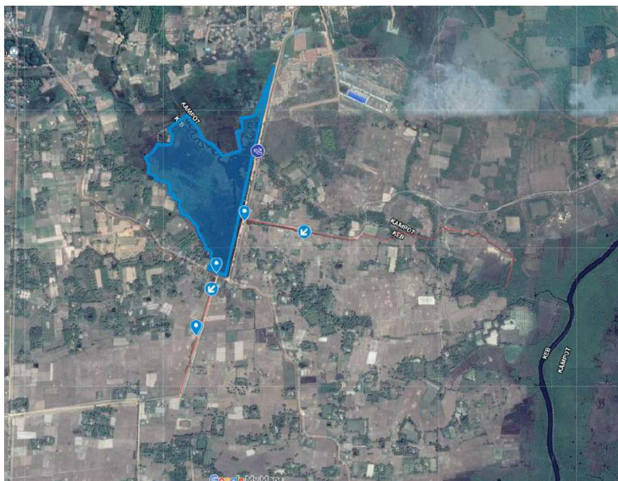
Figure 2 “Map 2 O Thmar Reservoir location”