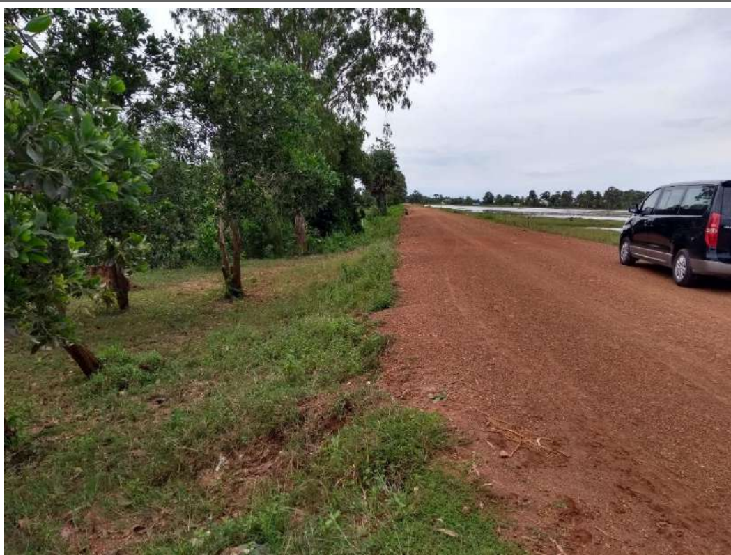
Figure 6 “Vegetation on the surface of O Thmar Reservoir and upstream face of the dam, adjacent to the spillway”