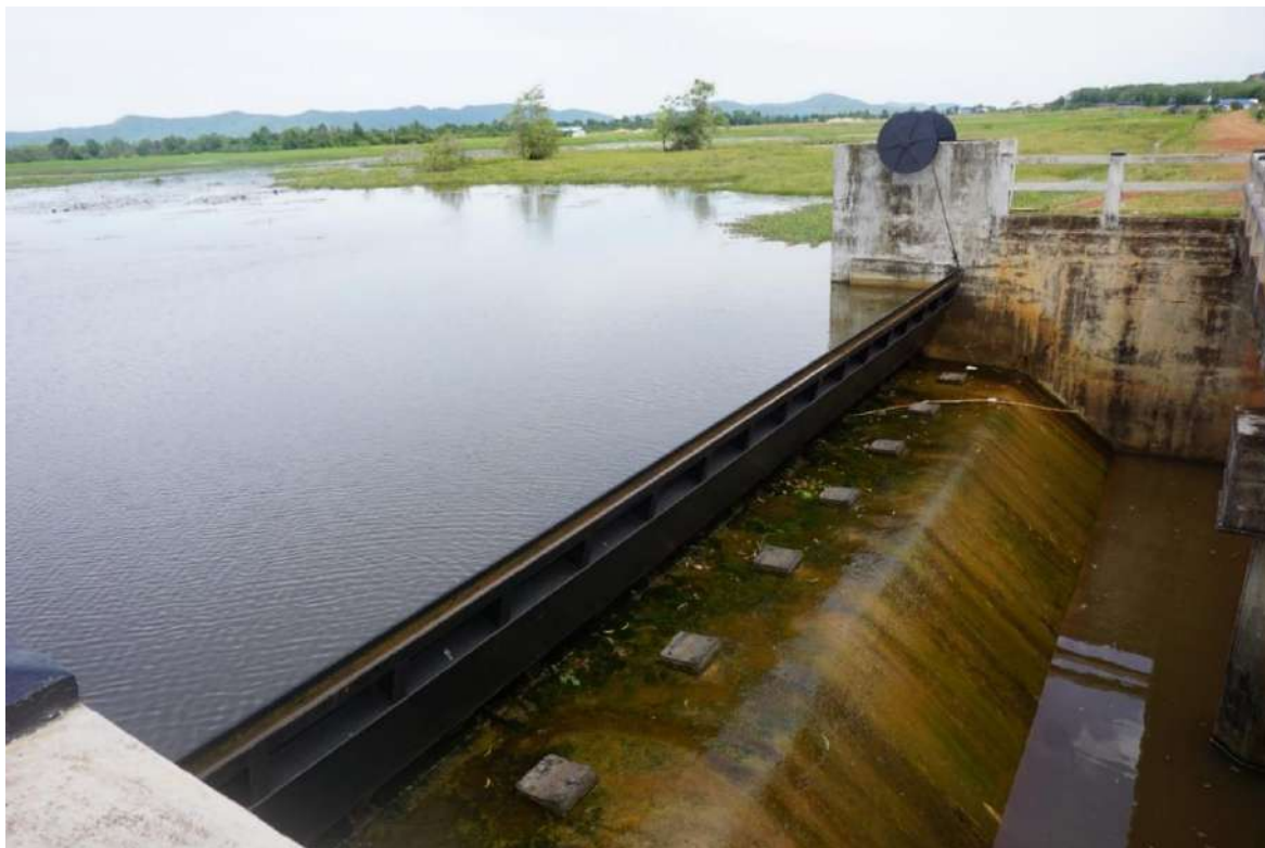
Figure 8 “irrigated rice paddy fields Kep province”