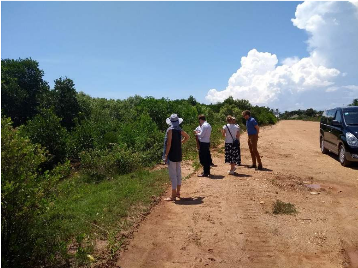
Figure 4 "The embankment would be constructed where the people are standing in this picture, on the sea-ward side of the road"