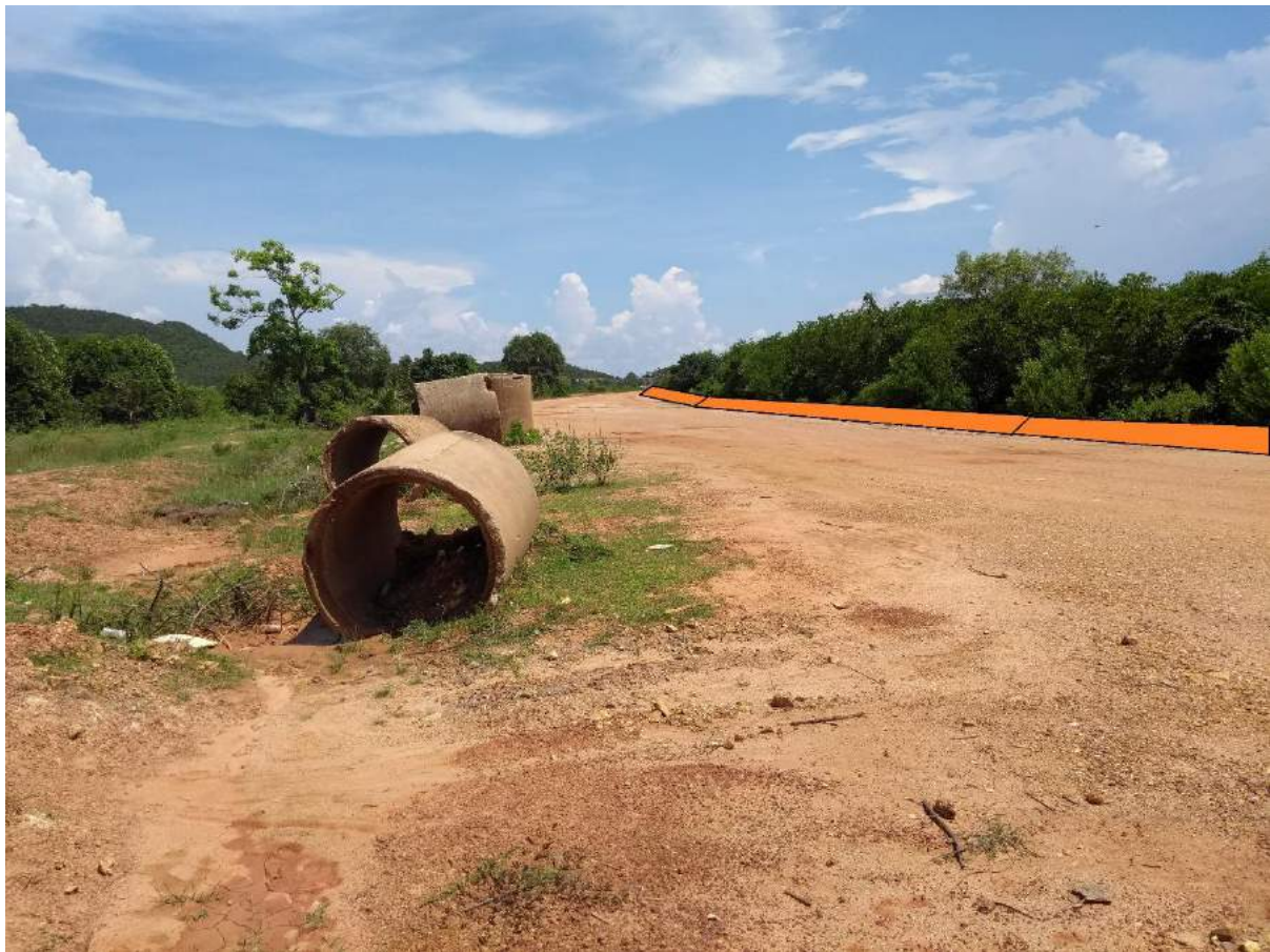
Figure 3 "A section of the coast road with the proposed embankment sketched in orange. Note that the sea is on the right of the picture, behind the mangrove. This picture is taken in the direction of travel from Kep Commune, toward Angkaol Commune"