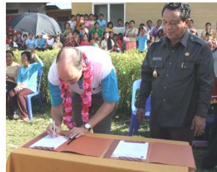
Signing of the hand-over documents