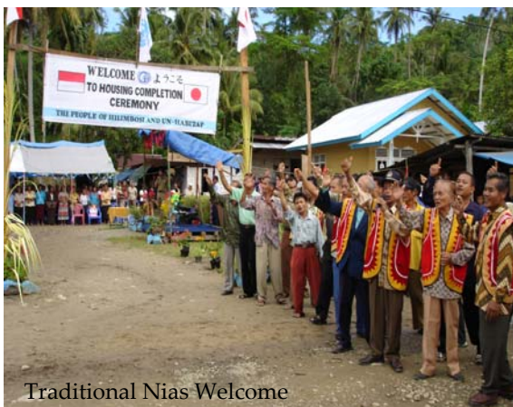
Traditional Nias Welcome