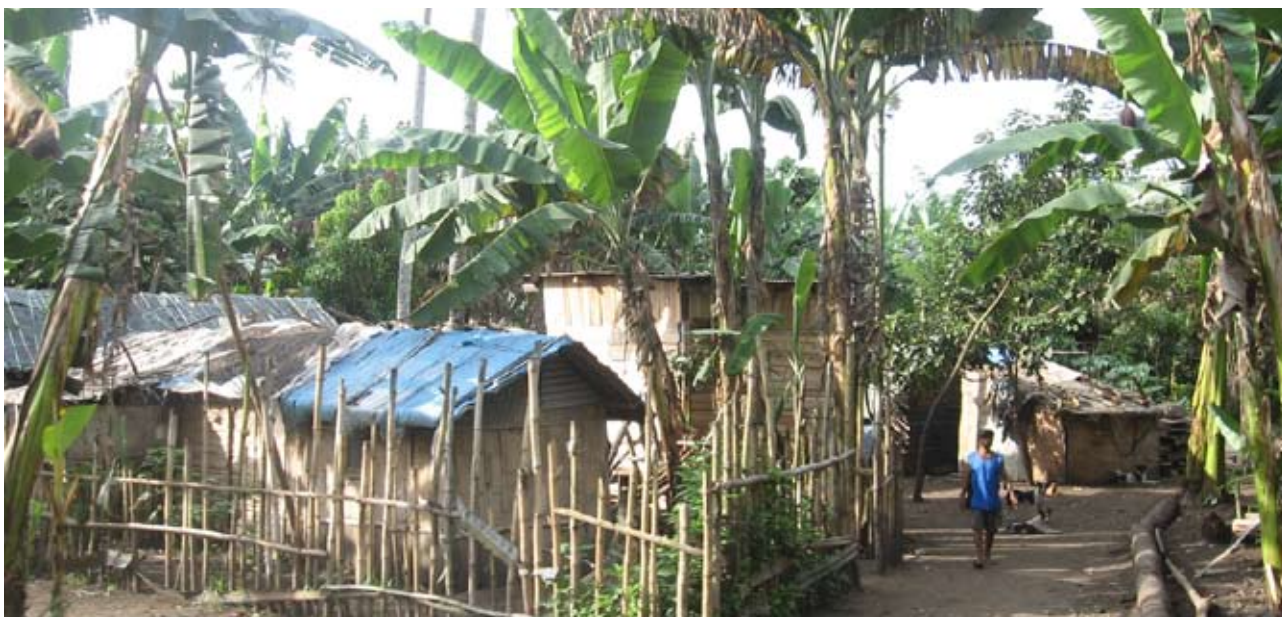
Squatter settlement in Kokopo