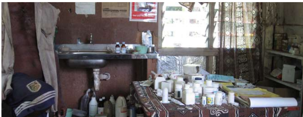
An urban clinic with its drugs and facilities

Kokopo has a high student to teacher ratio in schools. Classrooms are overcrowded while some schools lack adequate facilities such as libraries, laboratories and teacher's houses. School fees are partly subsidized by the National Government. However, some families still can not afford the fees and as a result most students are deprived of their right to education. Kokopo has 10 elementary schools, seven primary schools and only two secondary schools. In addition, there is one Business College, two vocational schools, one technical school, one teacher's college, a University Open Campus, and four private schools. The existing educational facilities are inadequate for the increasing population, and there are great inequalities in teaching standards and services between government-run and private schools. There is a need to upgrade the existing educational facilities and improve accessibility to education.