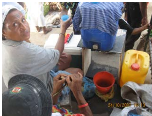
Women in the informal sector