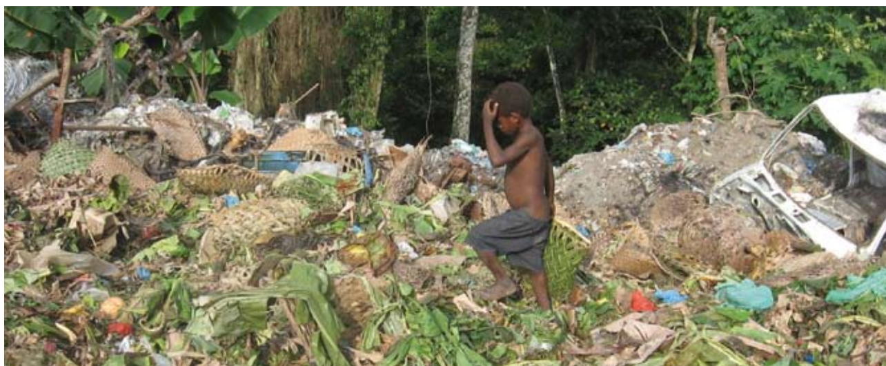
Raniolo Dump Site in Kokopo