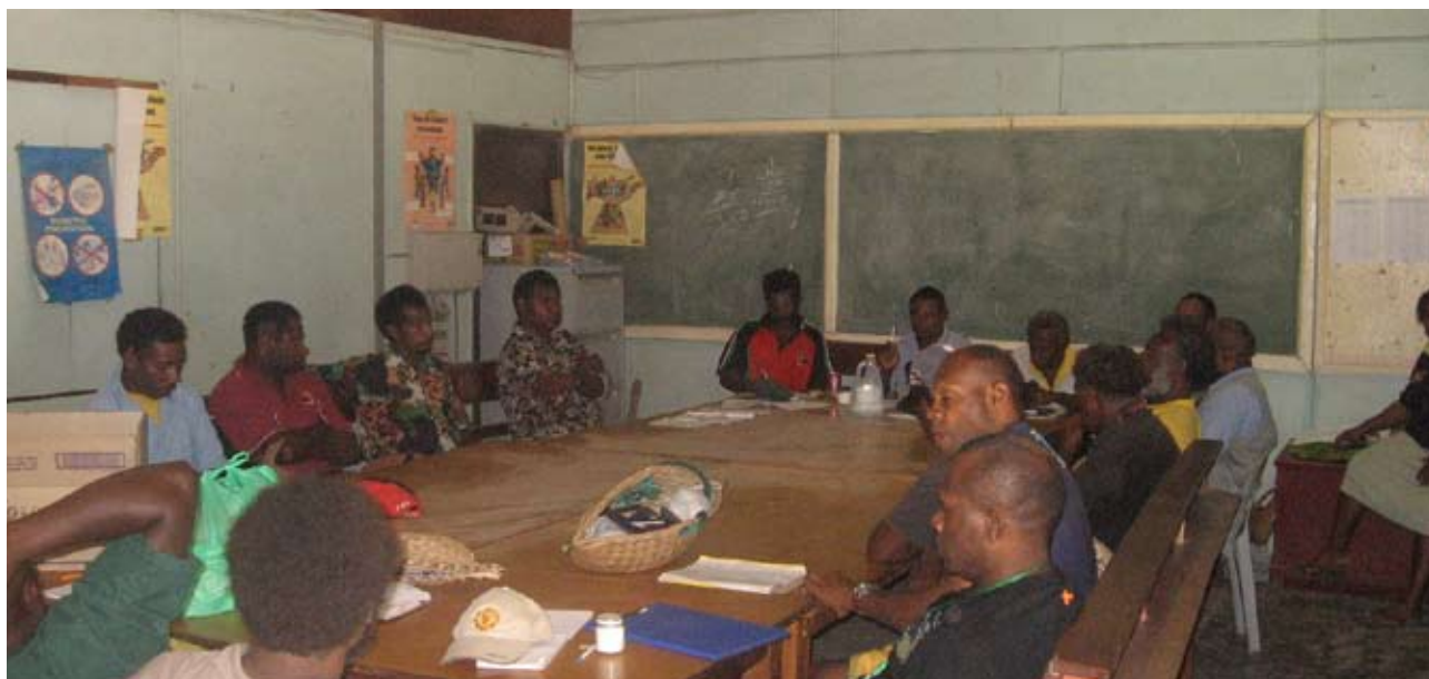
Local community leaders in a rural village